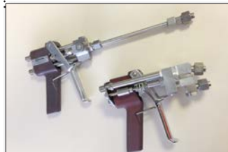
Airless 2-component hand spray gun M 98:2 and M1:1