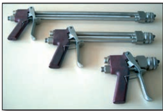
Atomising air hand spray gun

* only in connection with needle point art.# 9120891