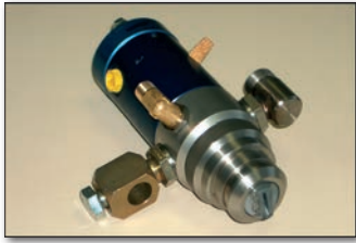
VIALINE Atomising paint spray gun