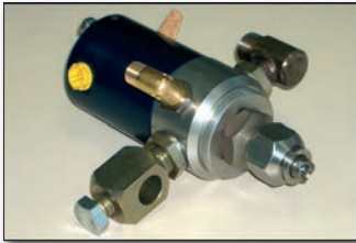
VIALINE Airless paint spray gun