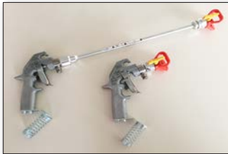
Graco® Airless paint hand spray gun