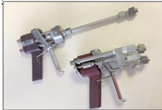
Airless 2-component hand spray gun M 98:2 and M1:1