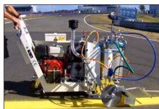
H9-2 Nürburgring in Nürburg, Germany