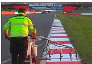
H9-2 Silverstone Circuit in Silverstone, UK