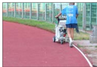
H5-1 Olympic stadium in Rome, Italy