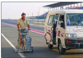
H5-1 Losail International Circuit in Doha, Qatar