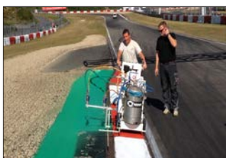
H9-2 Nürburgring in Nürburg, Germany